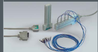
Ergonomically shaped mini input boxes