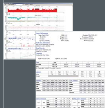
Polysmith sleep analysis software