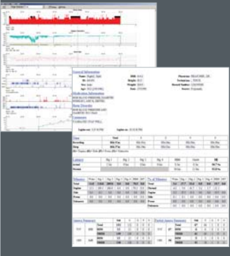
Polysmith sleep analysis software