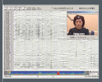
Latest generation digital video