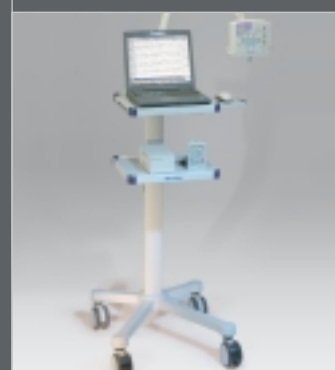
Portable EEG-9100 system on a mobile stand, e.g. for use in intensive care unit