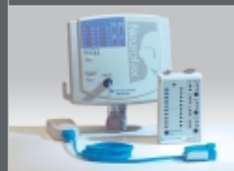
Sleep/PSG input box JE-912AK