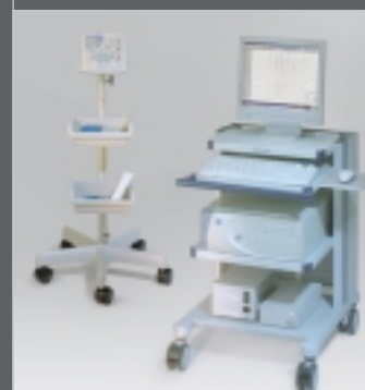
EEG-9200 system with trolley and electrode input box for the EEG laboratory